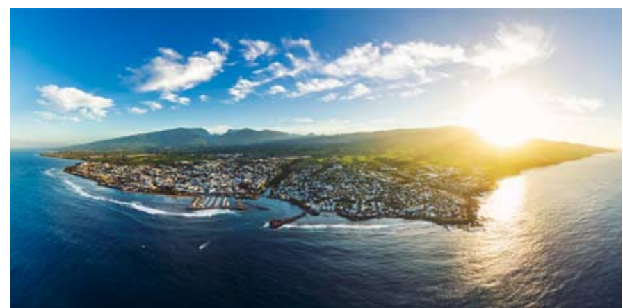
Littoral Vue du Ciel22 Saint Pierre