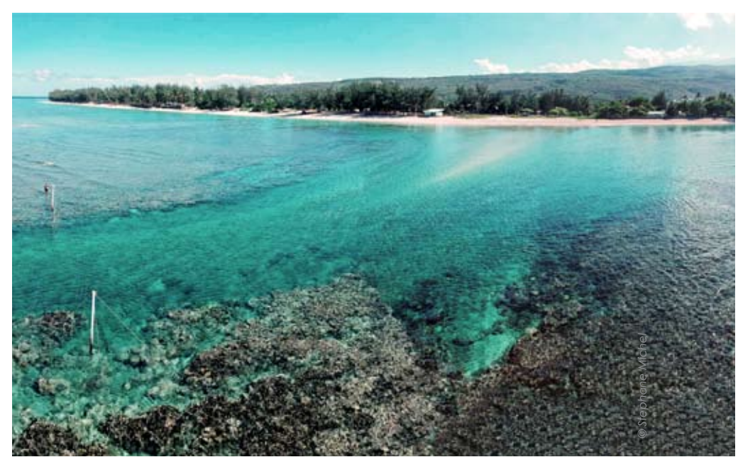
Petite ile Plage de Grande Anse