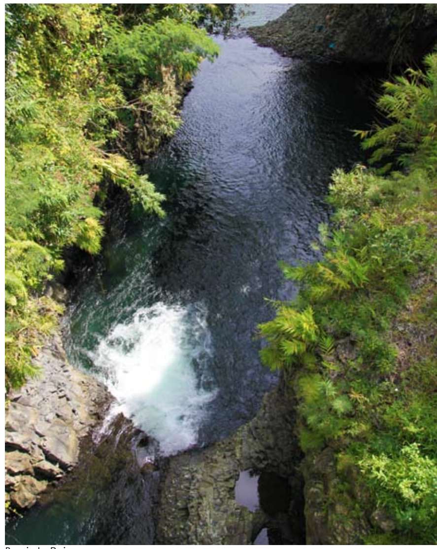
Bassin la Paix