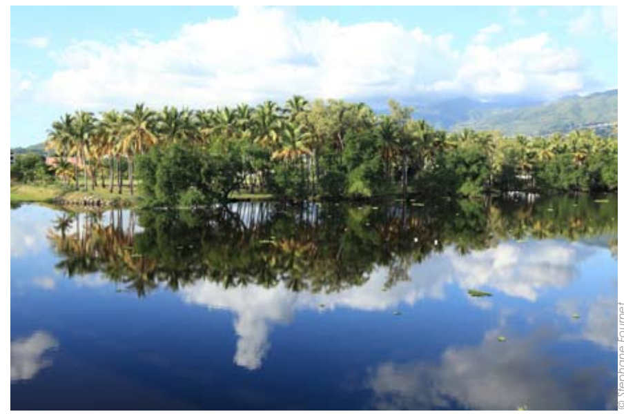
Saint Paul Etang

Apart from its natural beauty, the island is also renowned for its genuine hospitality which delights visitors. There are 51 star-rated hotels in La Réunion (as of 31st May 2019). The total capacity of these hotels is 2352 rooms. Enjoy an unparalleled stay in top quality accommodation promising modernity, authenticity, comfort and originality. There are also hotels with a 'zen' ambiance that will awaken your senses, as well as luxurious hotels at exclusive locations, charming boutique hotels and holiday homes with ocean views to make your holiday just perfect. These various accommodation options in the 'highlands' or on the coast are ideal for a well-deserved break. The 5 to 3 star hotels, graded according to French standards are spread out over different locations on the island. There are also plenty of homestay options. There are more than 250 bed and breakfasts and holiday homes spread across the island.