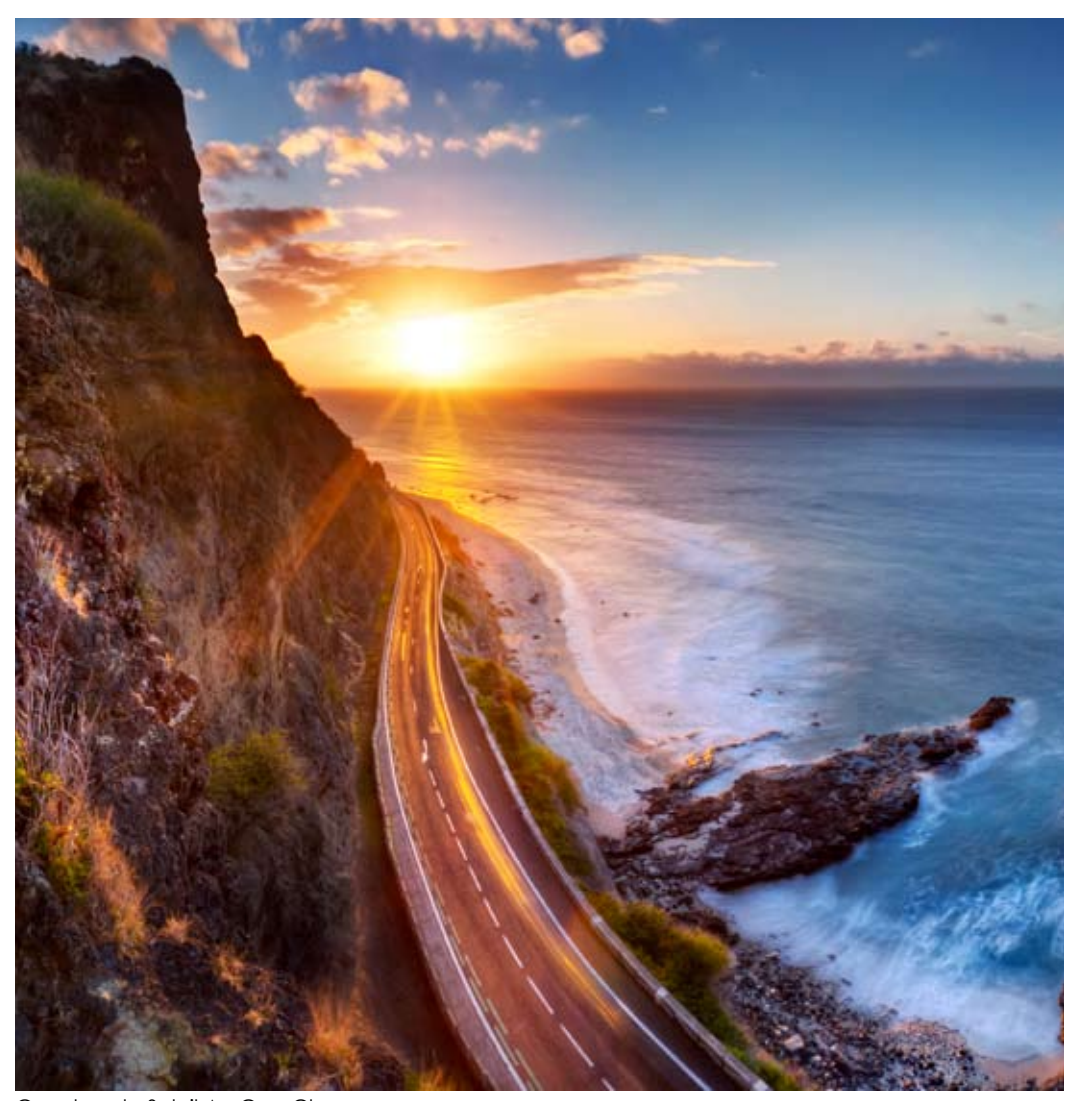
Coucher de Soleil Au Cap Champagne