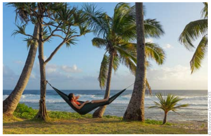
Ambiance 7en Detente

Mostly light summer clothing is suitable but it is recommended to pack some warm clothes as at higher altitudes it may be cold in the evening.