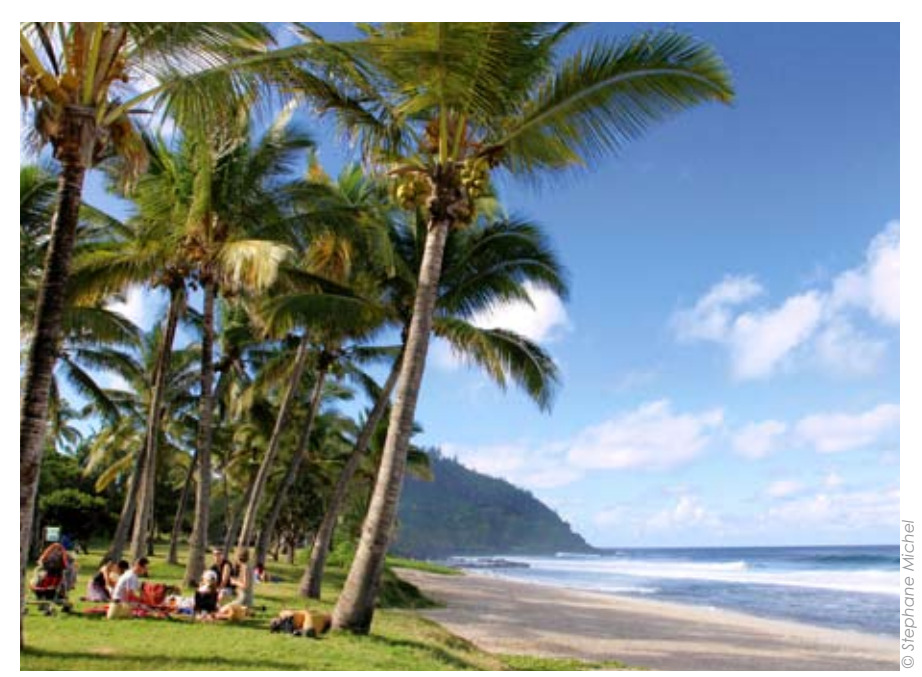
Petite ile Plage de Grande Anse